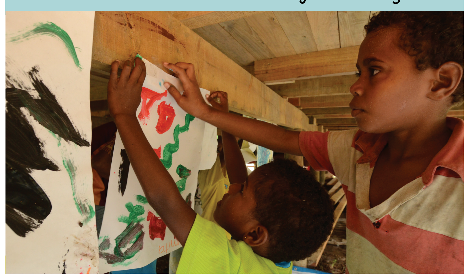
What was YOUR brave idea?

They decorated the place with colourful paintings to celebrate how brave they had been that night. And they learned of other children who saved their families from the cyclone's fright.